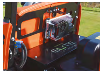
ELITE lithium battery & on-board high frequency 18 amp, 48V DC output, 85 - 265V AC 45 - 65 Hz input