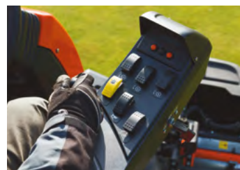
Constant clip rate control during all operations