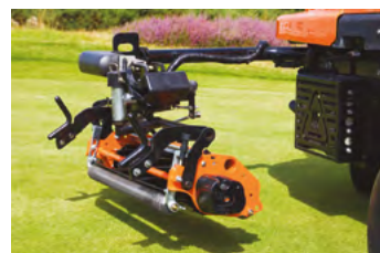
Easy access swing-out centre cutting unit

New linear actuators with exceptionally long life